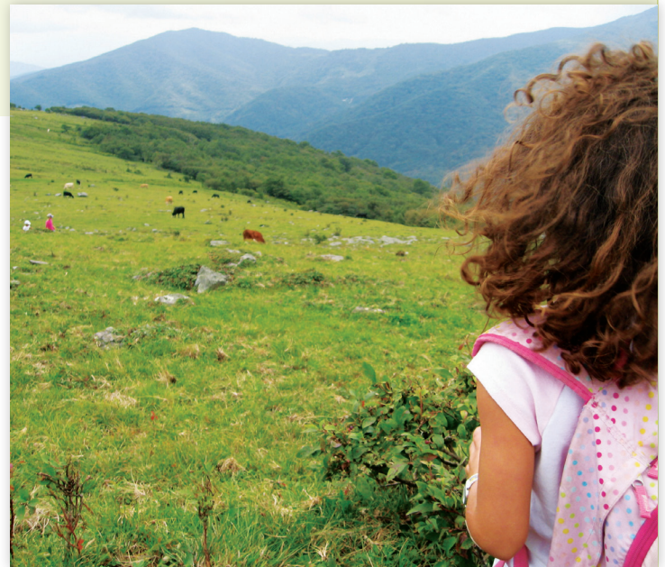
Big Yellow Mountain