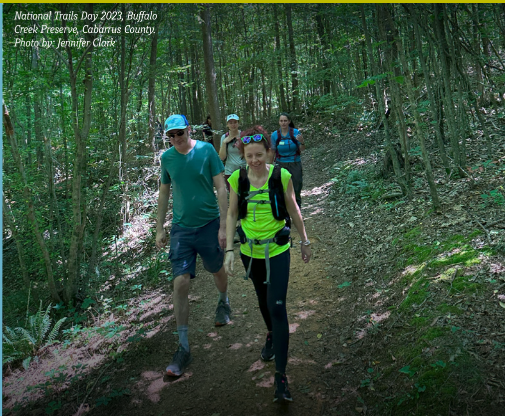
National Trails Day 2023, Buffalo Creek Preserve, Cabarrus County.