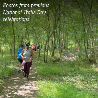
Photos from previous National Trails Day celebrations

LACE UP YOUR SNEAKERS AND JOIN US IN CELEBRATING NATIONAL TRAILS DAY!