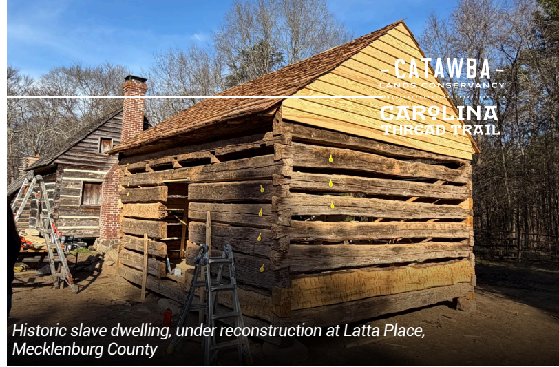
Historic slave dwelling, under reconstruction at Latta Place, Mecklenburg County