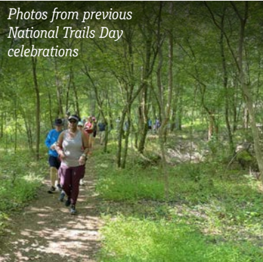
Photos from previous National Trails Day celebrations

LACE UP YOUR SNEAKERS AND JOIN US IN CELEBRATING NATIONAL TRAILS DAY!