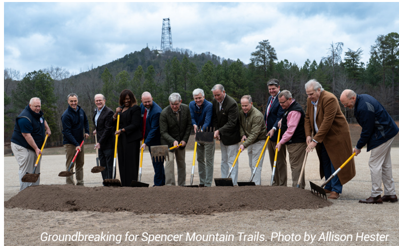
Groundbreaking for Spencer Mountain Trails.

Construction is underway on the new Spencer Mountain Trails located at George Poston Park in Gaston County. Staff celebrated with a groundbreaking ceremony with partners in February. This project is the culmination of over 25 years of effort to protect and bring public access to Spencer Mountain, and is only possible thanks to the support of many generous partners, including CaroMont Health. Trails are anticipated to open at the end of 2026 or early 2027.