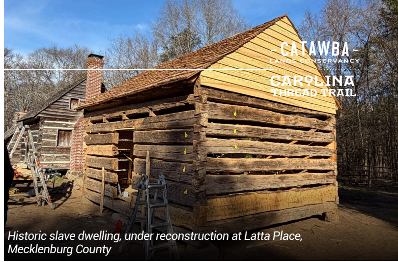
Historic slave dwelling, under reconstruction at Latta Place, Mecklenburg County